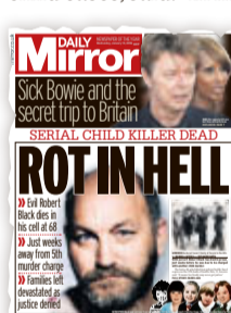
MONSTER We told of his death yesterday