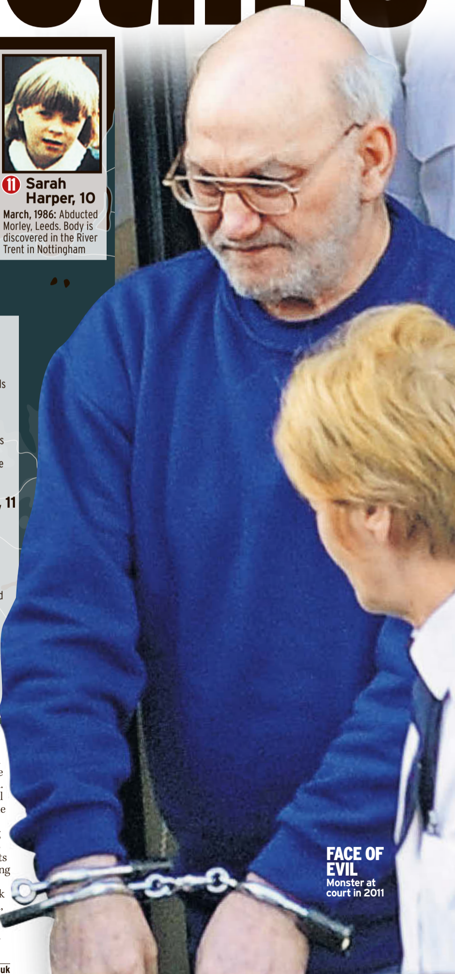
FACE OF EVIL Monster at court in 2011